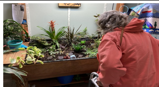
A resident at McKay Healthcare & Rehabilitation Center in Soap Lake, Washington spending time observing the garden.

Funded Entity: LeadingAge Washington in Partnership with Eldergrow