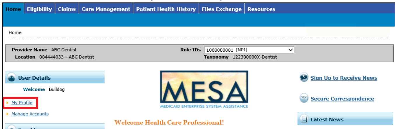
Figure 1: Access My Profile