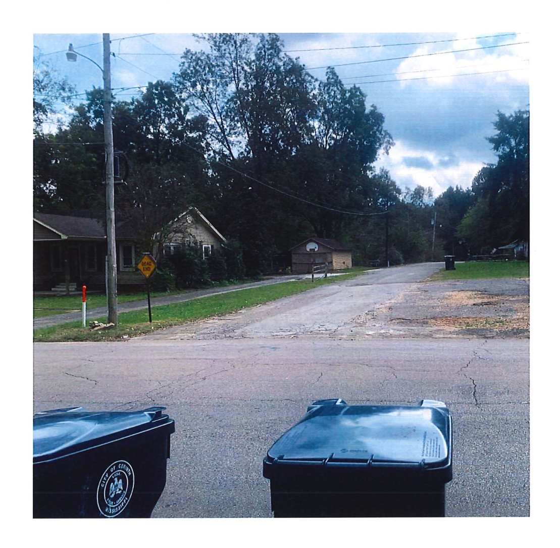
Picture of residences located directly across the street from Proper I SVL