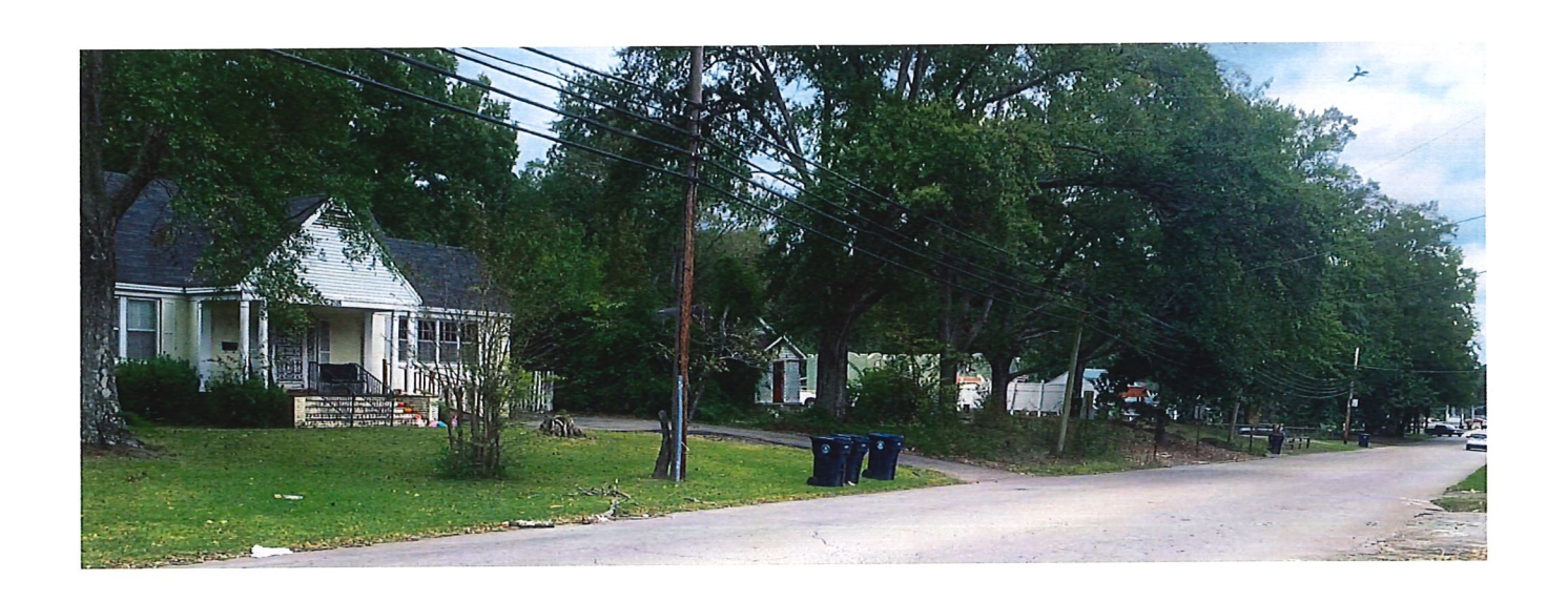
Proper I Supervised Living Home (left) operated by Region IV with other privately owned residences on same side of street.