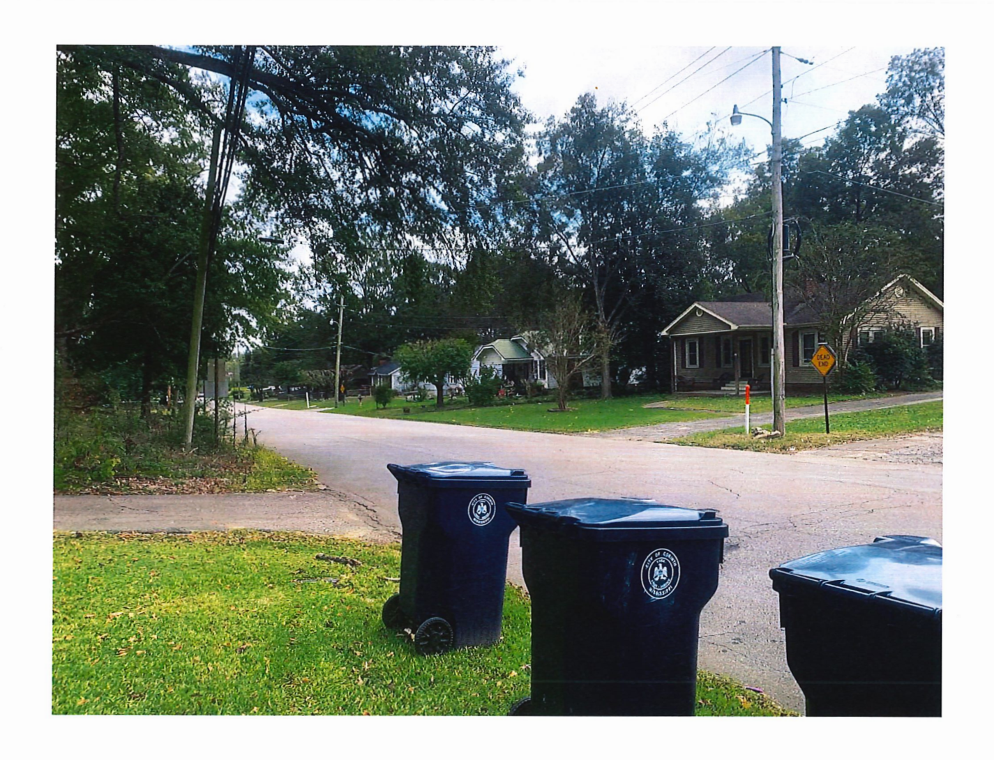
Picture of private residences located across the street from Proper I Supervised Living Home (left side of home)