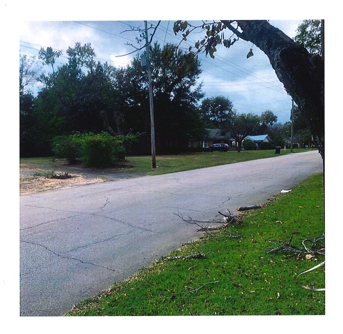
Picture of private residences located across the street from Proper I SVL (right side of street)