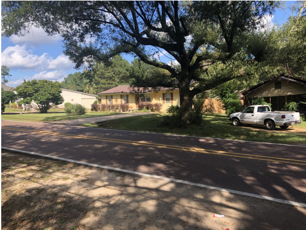
Across the street from the HCBS Supervised Living home. Residential homes owned by private citizens.