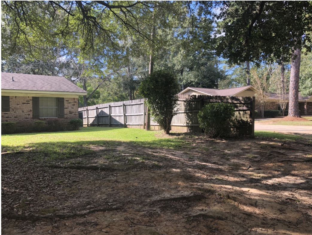
Fence separates the Millcreek ICF Group Home (left) and the HCBS Supervised Living Home (right)