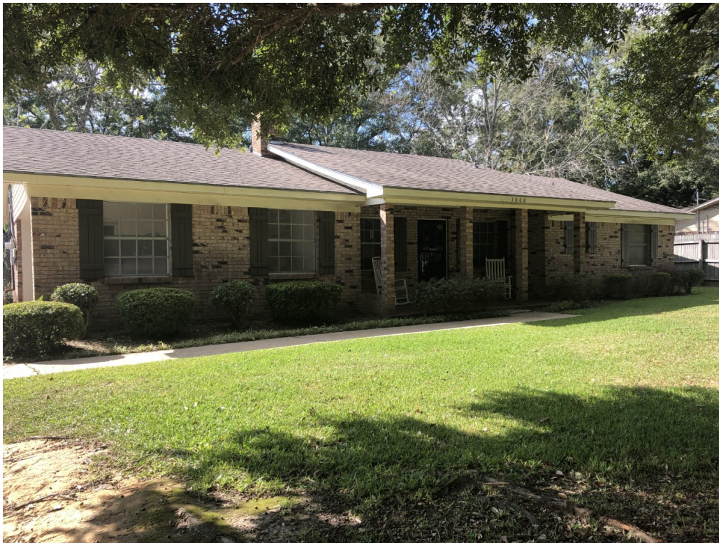
The HCBS Supervised Living Home – five (5) persons receiving ID/DD Waiver Supervised Living – each person has a private room. Fence surrounding the property and separating the home from the ICF Group Homes.