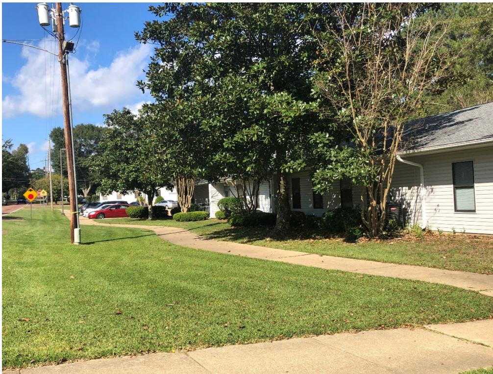
Administrative offices, outpatient psychiatric program located across the street from the main campus. Note stop sign at intersection. Past intersection homes on each side of the road.