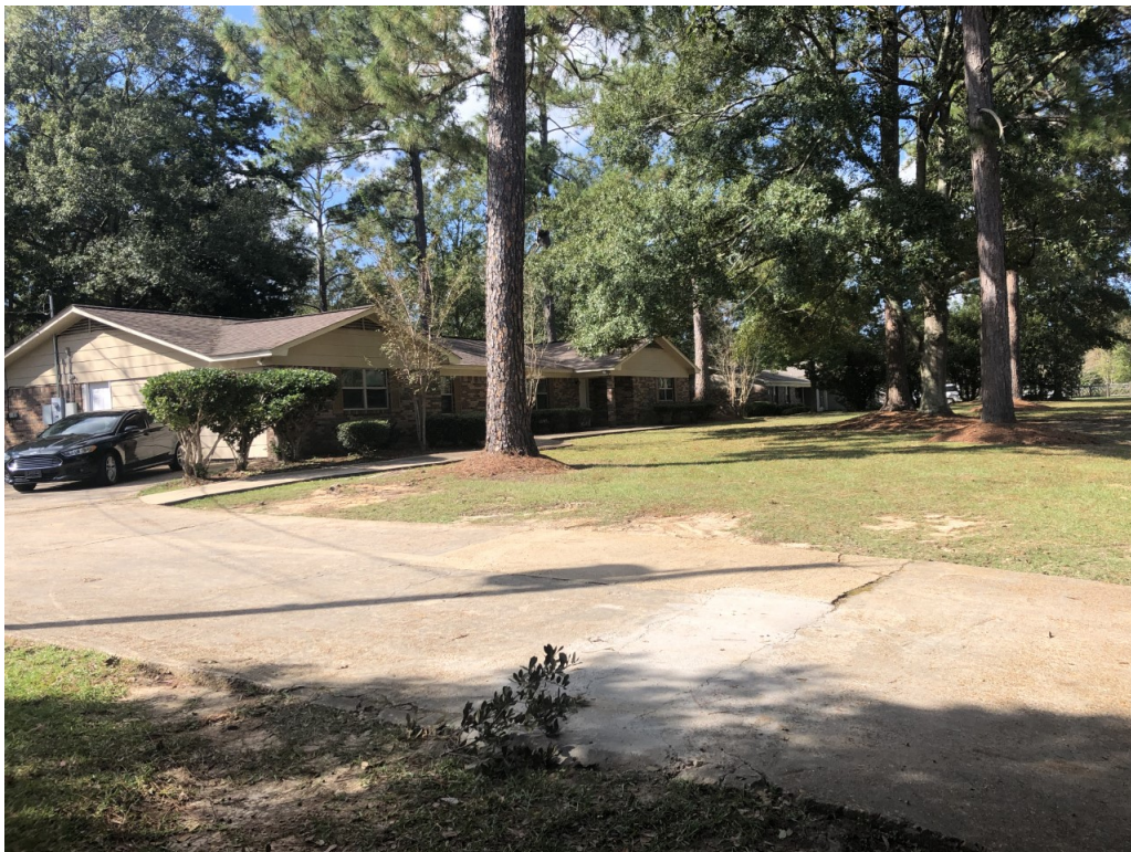
Picture of houses 3,4, and 5 are Millcreek ICF Group Homes for children/adolescents under 21. Appears to be residential neighborhood – not institutional appearance.