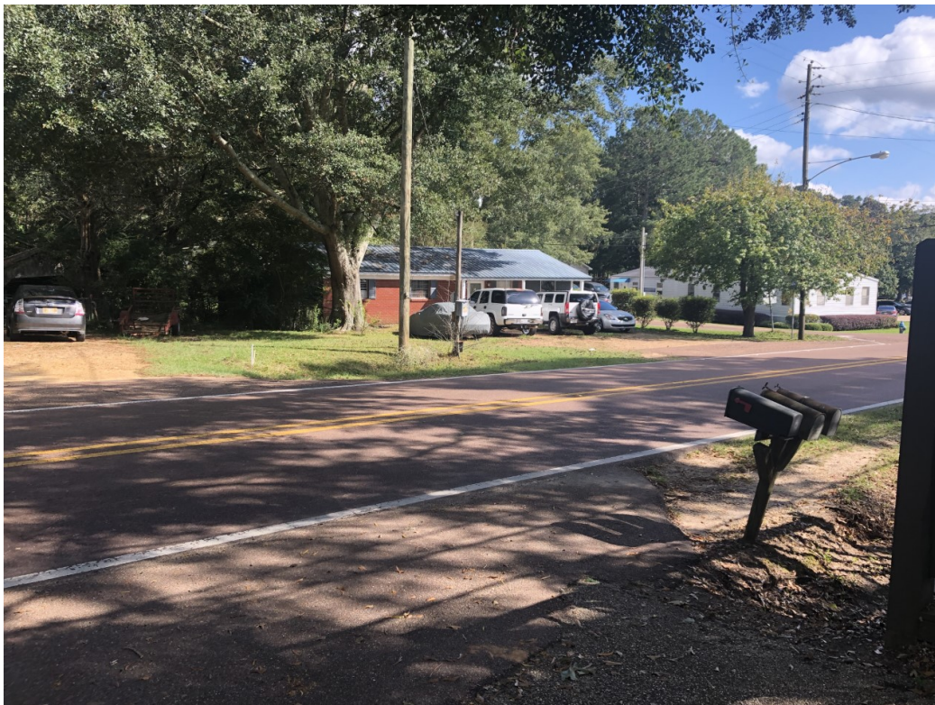
Across the street from the HCBS Supervised Living home. Residential homes owned by private citizens.