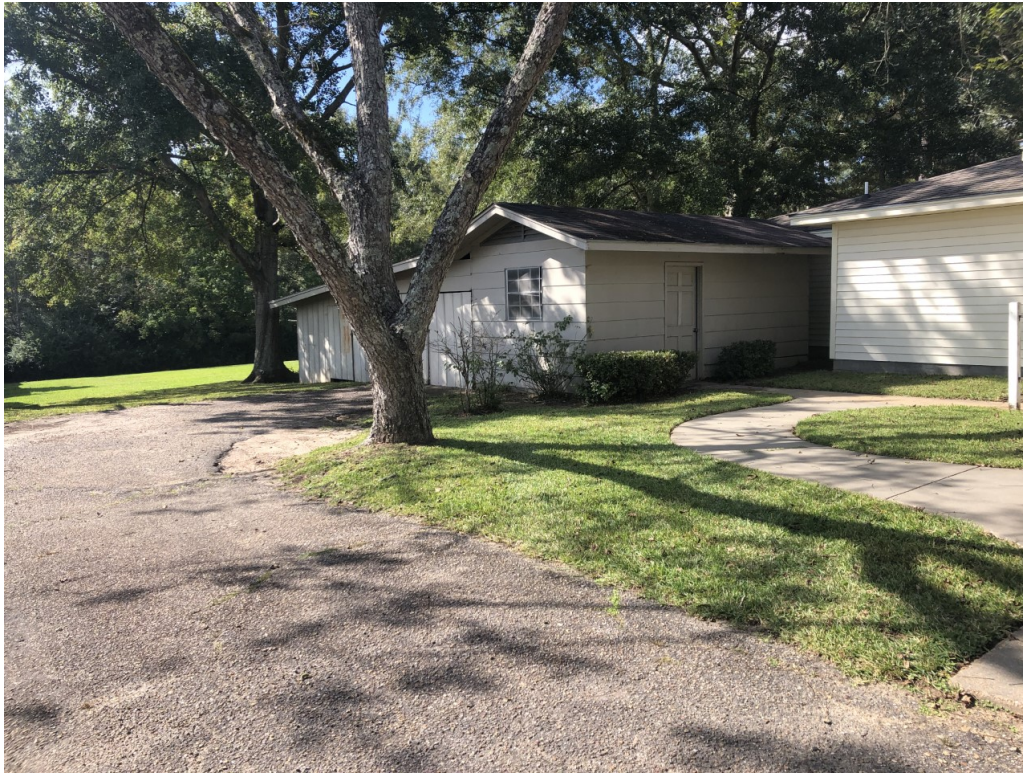
The back of the HCBS Supervised Living Home – large back yard