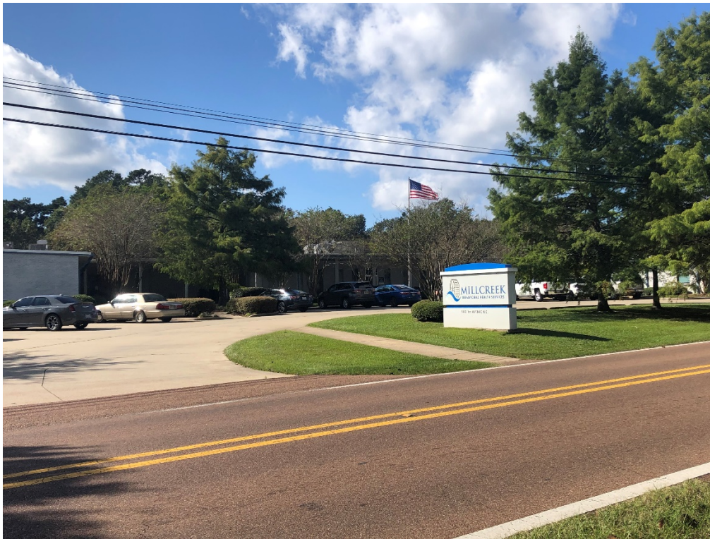
Millcreek Psychiatric Residential Treatment Facility (PRTF) and Intermediate Care Facility for persons with IDD (ICF/IDD) – for children and adolescents 21 years of age or younger – located 900 1 st Avenue, Magee, MS