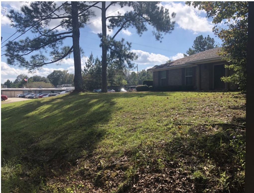
Picture above shows the Millcreek ICF Group Home from the other direction – note Millcreek PRTF/ICF across the street.